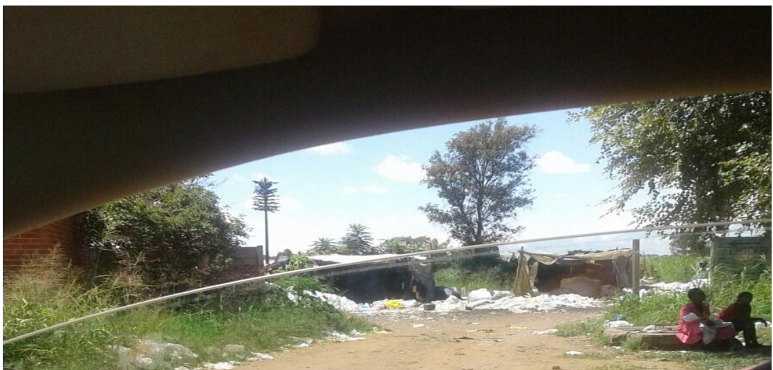
Figure 3: A plastic house at the Mukuvisi River

The major factor causing children to engage in sex work in Epworth is a lack of basic necessities such as food, shelter and clothing. At the Mukuvisi river bank young girls as young as 8 years old have been lured into prostitution because they had nowhere to live. I interviewed Mai Brendon who owns a shack built out of plastics and wooden poles.