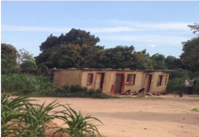
Figure 4: A house in Magada, Epworth, Harare

The District child welfare officer for Harare Central at the department of Child Welfare and Protection services noted that although the department was aware of the dire need for shelter the department only provides shelter for children deemed to be in need of care by the court. These children are referred to them by NGOs and community volunteers.