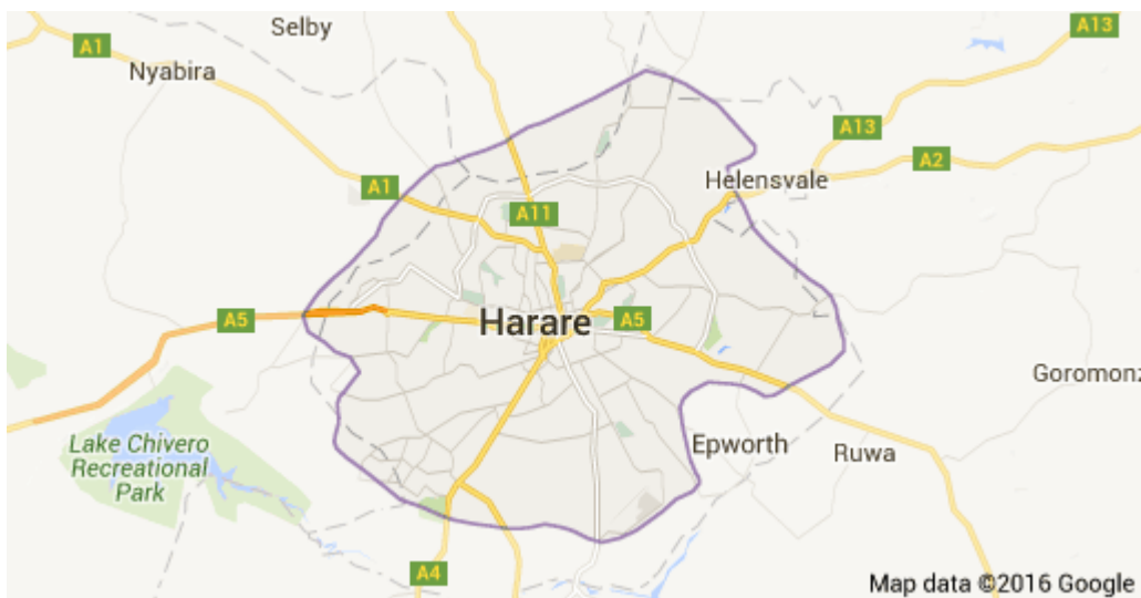
Figure 2: Map of Epworth, Harare (Map data: Google:2016)

Initially the research was intended to be limited to the Mukuvisi river and its environs, and close to Seke road in Harare. However, after my first field visit I discovered that a large number of the girls operating in the area had come from Epworth and were now living there or they come there on a daily basis to look for clients. Epworth is located 14 km from Harare and the Mukuvisi River flows from the east of Harare and cuts through the city centre. It is in this area in the city centre where sex workers, including young sex workers, have found a base targeting mainly clients from the Graniteside industrial area. In Epworth the research was limited to the Magada area, Overspill and Domboramwari.