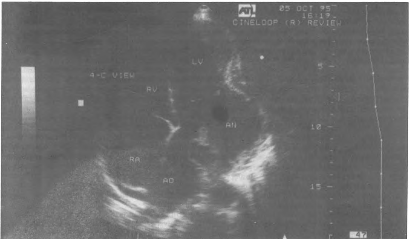
Figure II: Parasternal long-axis echocardiographic view showing a large annular subvalvular left ventricle aneurysm communicating with both the left ventricular to the posterior mitral valve leaflet and with the left atrium. RV-right ventricle, LV-left ventricle, Ao-aorta, MV-mitral valve.

On regular review over the course of the next six months he reported several attacks of palpitations of sudden onset and offset. He also experienced frequent episodes of near-syncope and three of actual syncope. The fever resolved and his symptoms of heart failure were controlled and cardiovascular examination during follow up remained unremarkable. During the course of his management he was advised to have a 24-Holter monitor examination for detection of arrhythmias and to undergo surgical excision of the aneurysm. He was undecided over the whole period of consultation and whilst still vacillating he suddenly collapsed and died.