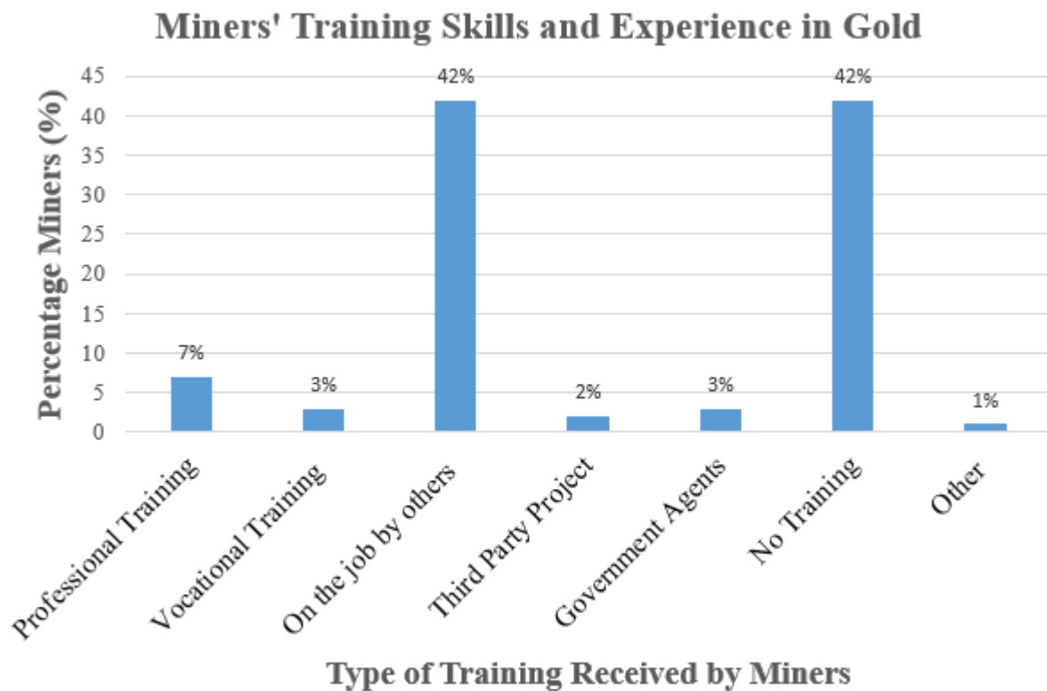
Figure 1. Zimbabwe Miners' training skills and experience in gold (Pact, 2015).

In order to transform the ASM into a more formal sector, there is first a need to transform the miner into a more responsible individual. This is possible through education and training. Education basically involves all the experiences that are acquired inside or outside the school by an individual. Turkkahraman (2012, p. 38) points out that: Society and education complete each other. Society cannot carry on without education and vice versa. Education affects not only the person being educated but also the whole community by starting from his/her family. In other words, raising sufficient number of efficient people for more prosperous society is the duty of education and educational institutions which have certain functions in the community. Burchi (2006) also argues that education can play a pivotal role in two separate ways, namely economic production and social change.