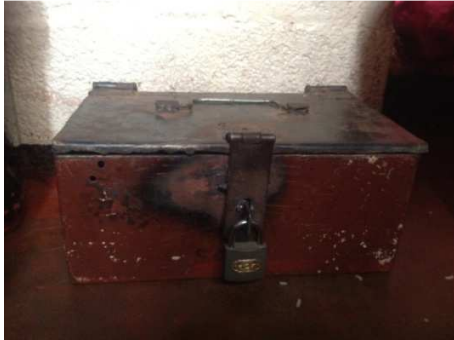
Fig 3: Safe box for keeping money in most burial societies

Burial societies have also come up with strategies such as enlisting the services of Mazowe mine authorities to help with the recovery of funds for members who fail to pay back loans. In such cases, a letter is written notifying mine authorities of the borrowed amount and offenders are compelled to sign against the amount to ensure authenticity of the claim. This money is deducted from the offender's salary at the end of the month.