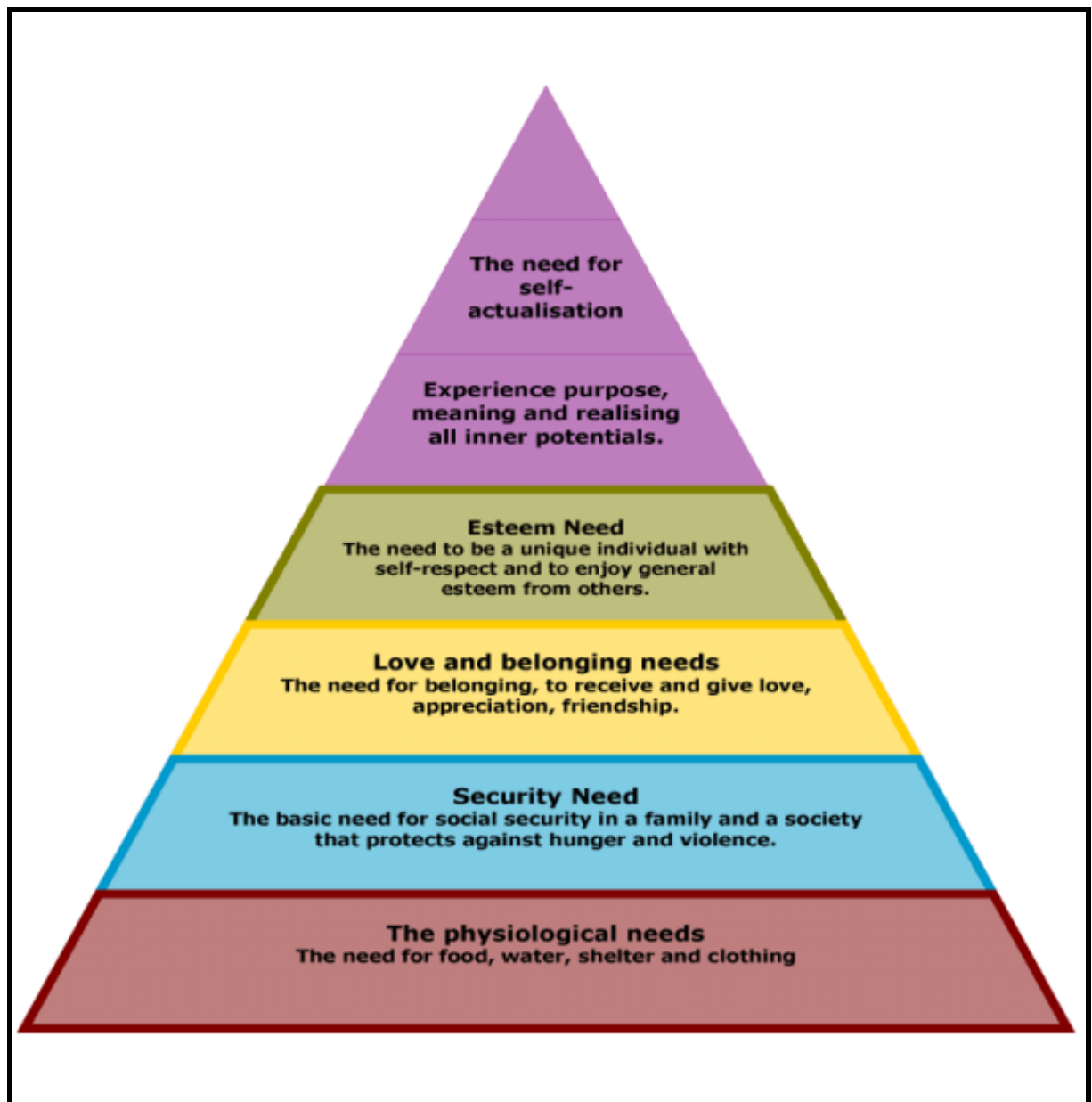
Fig 1: Maslow's Hierarchy of Needs (Adapted from Lahey and Cimineno 1981)

The most fundamental and basic four layers of the pyramid contain what Maslow called "deficiency needs" or "d-needs": esteem, friendship and love, security, and physical needs. With the exception of the most fundamental (physiological) needs, if these "deficiency needs" are not met, the body gives no physical indication but the individual feels anxious and tense. Maslow's theory suggests that the most basic level