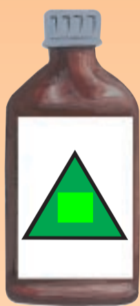
HARMFUL IF SWALLOWED