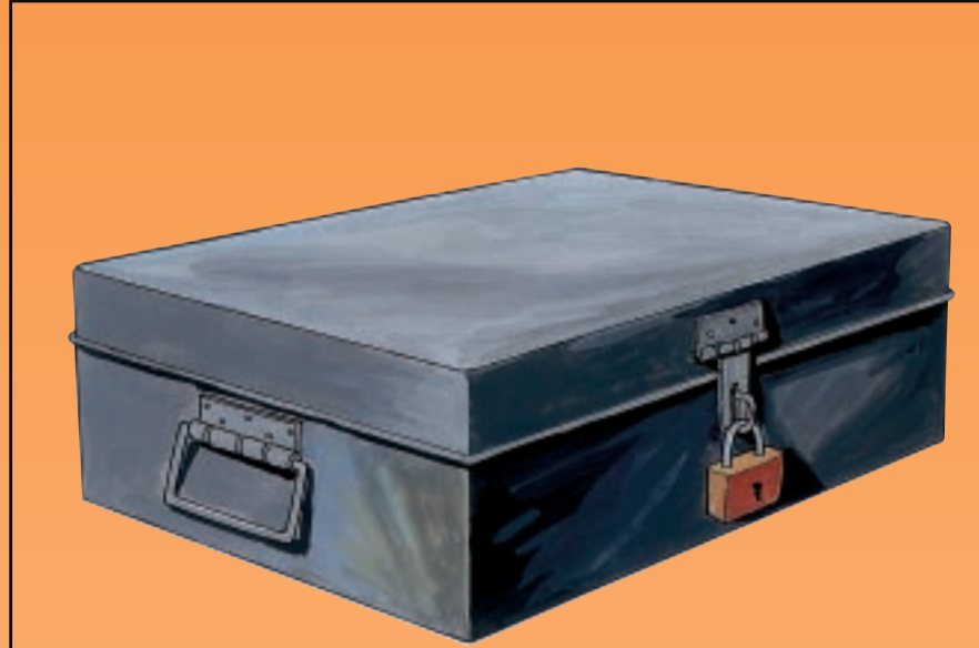
Metal or wooden box under lock and key