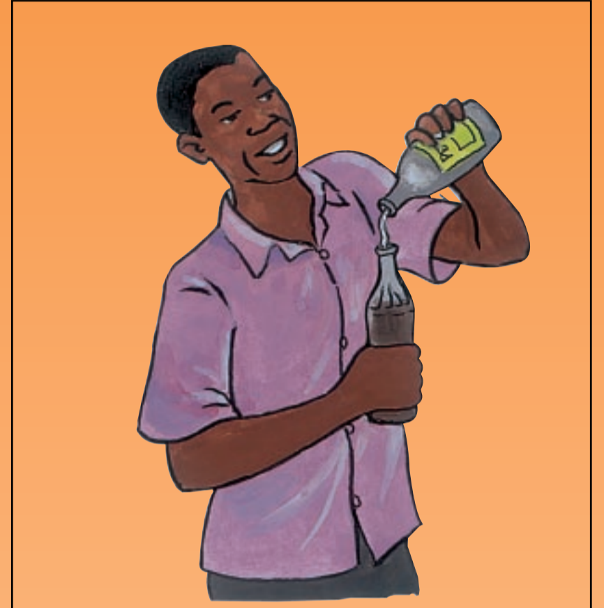
Do not transfer into other containers