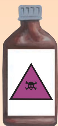
VERY DANGEROUS POISON

Overalls, apron, rubber gloves, boots, goggles and respirator